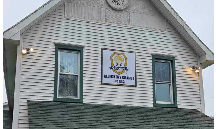
Allegheny Grange #1843 (PA) recently installed a new sign on the front of their Grange Hall, inviting members and the community in to learn and enhance the community.

On the afternoon of November 2, 2024, members of Allegheny Grange #1843 hosted their first