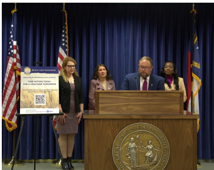
Information about the Rural Life Initiative was on display by the North Carolina state government.