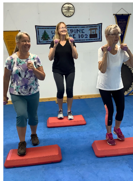
In Montana, Whitepine Grange is able to provide fitness classes thanks to a grant from the Rural Life Initiative.

In Montana, a Grange saw the need for fitness classes so that residents of three nearby communities didn't have to drive an hour each way in miserable weather to work on fitness and well-being. In North Carolina, a Grange had a