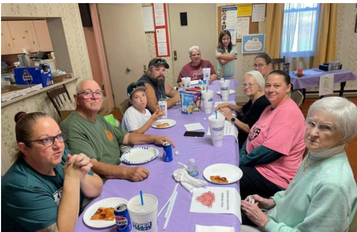
A team of volunteers enjoys fellowship before their first-ever spaghetti take out dinner in November.

The dinner was a resounding success, fostering a spirit of camaraderie among members and guests alike.